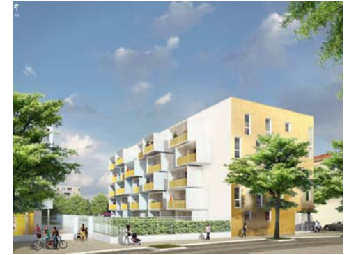
Avenue Marcel Paul