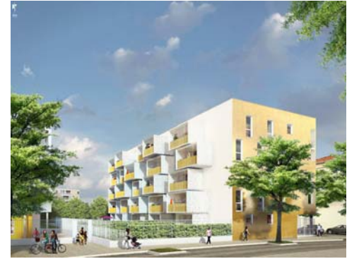
Avenue Marcel Paul