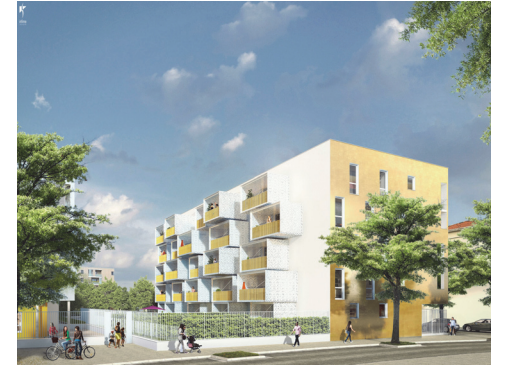
Avenue Marcel Paul