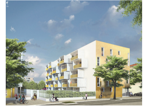
Avenue Marcel Paul